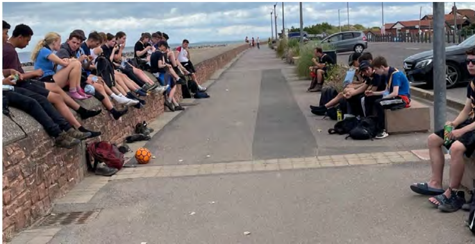
Here is a picture of possibly the best beach in Devon